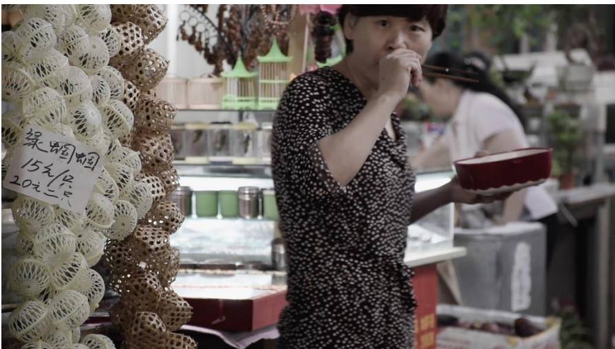
Kristina Inčiūraitė "The Echo of the Shadow", 2015, film still